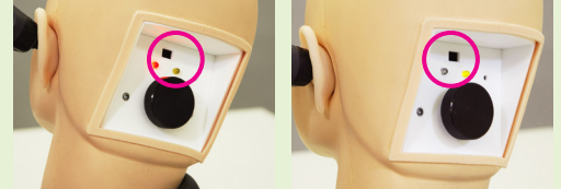
Alarm against painful insertion