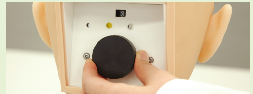
Quick switch between cases