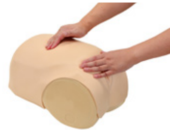
Palpation of uterine fundus