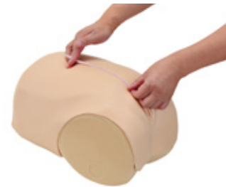
Measurement of fundal height