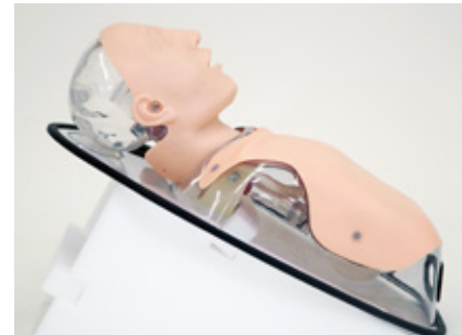
The manikin can be set in Fowler's position.